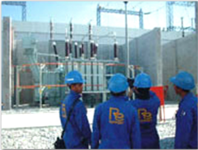
On Site Thermographic Scanning