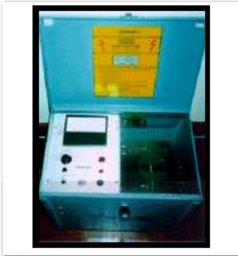
“Hipotronics - USA” Oil Tester