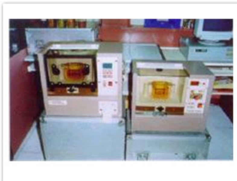
“Foster-AVO” International Oil Tester